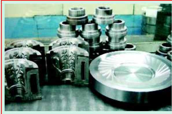
VARIETY OF GLASS MOULDS