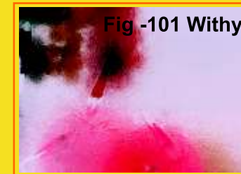
Fig -101 Withy

SHISHEH TABAN figured products are submitted in the following patterns.