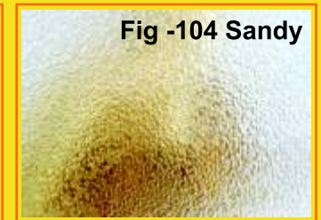
Fig -104 Sandy