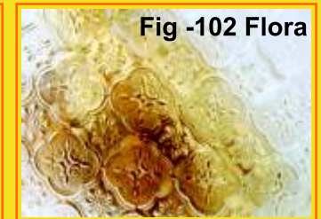
Fig -102 Flora