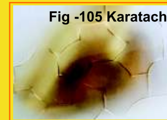
Fig -105 Karatachi