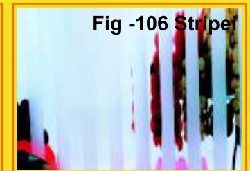
Fig -106 Striper