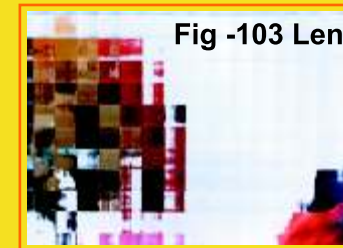
Fig -103 Leni