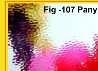
Fig -107 Pany