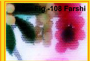
Fig -108 Farshi