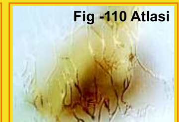
Fig -110 Atlasi